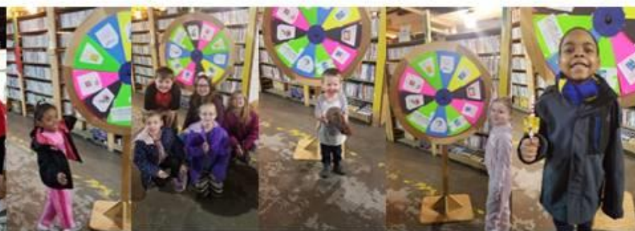
Spin the Wheel & answer questions about Dr Seuss.

We had many Dr. Seuss books to read to the children.