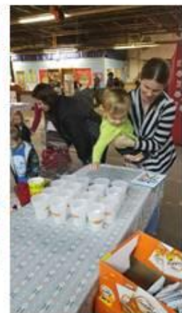
Various Ball Toss Games.