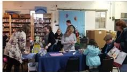
Making their own Horton the elephant at the craft station.