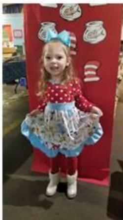
So much fun at the picture booth..