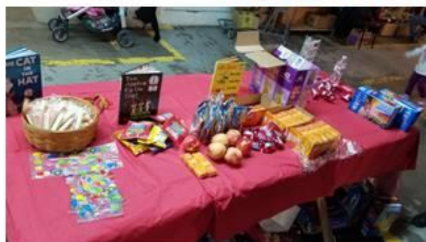
Snacks for all.