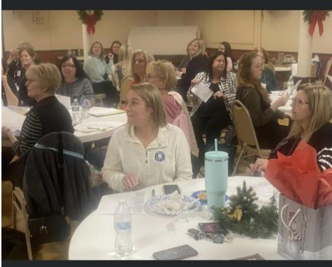
Holiday Party with Christmas Carols