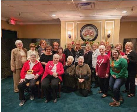
Annual Christmas Party