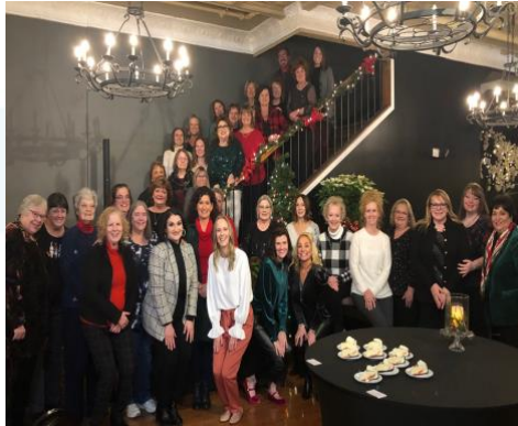
Annual Christmas Party