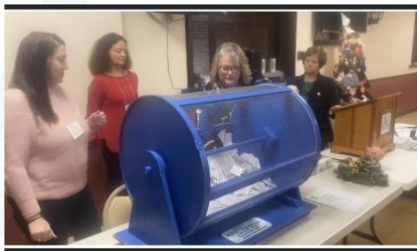
Diamond Raffle Drawing

The Altrusa Club of Bucyrus, Ohio shared kindness, books, and stuffed animals with the Kindergarten Students of Bucyrus City Schools. Club members read Arthur Books to the students, after which each student received 3 books and 3 stuff characters to go along with the book. What fun is it to have a classroom guest without a snack. The kindergarteners enjoyed oreos and milk, while club members enjoyed many hugs of gratitude.