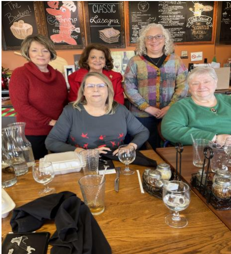
Saginaw Christmas luncheon