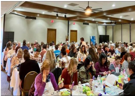
November Purse Bingo Fundraiser

We have planned again this year to recognize first responders in the area (police and fire) with cookies on Valentine's Day. And we will again donate appetizers and desserts in February for the Lima Literacy Council's annual fundraiser – a Scrabble Event. Our focus soon will be on preparing for our 2 nd Annual "Hats, Heels, and Horses" Kentucky Derby themed fundraiser on May 4, 2024. We have been able to book a larger venue site and hope to sell a lot more tickets. We may be small, but we are mighty!