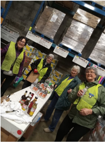
Pictured left: Altrusans of Nanaimo, BC sort boxes and pallets of food that come in for distribution to residents of Vancouver Island.