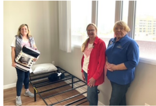
Pictured right: Altrusans of San Diego, CA help stage a room for a formerly homeless resident with grant funding from the International Foundation.