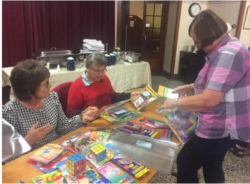
Pictured: Altrusa International of Oamaru, NZ members made distraction packs for children who are in traumatic situations. As a coordinated effort of District Fifteen, 2,000 distraction packs were made and distributed to emergency service providers throughout New Zealand. Each Altrusa Club in the District made and distributed 100 packs.