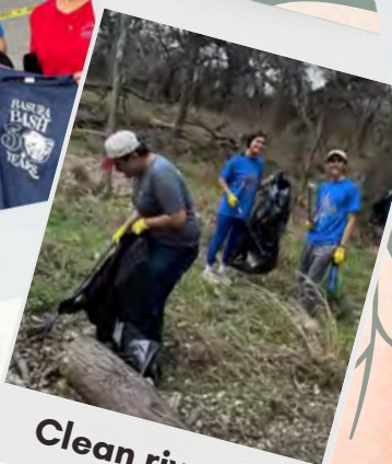
Clean rivers & waterways