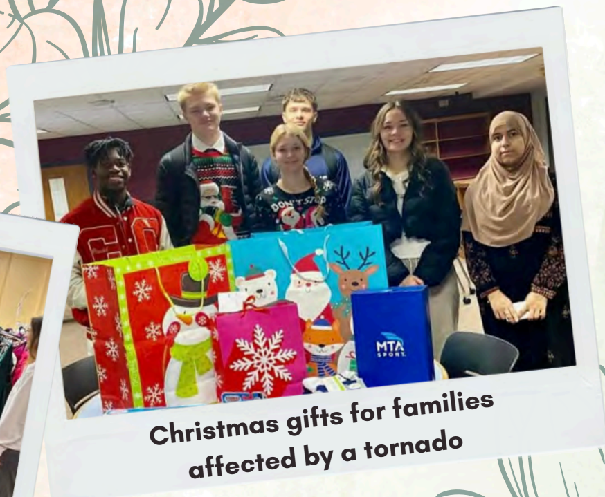
Christmas gifts for families affected by a tornado