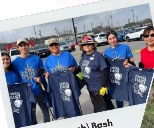
Basura (Trash) Bash