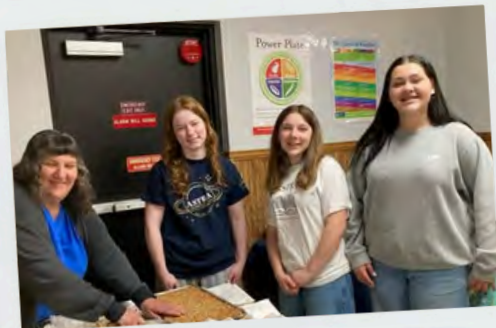
Book Walk & Give-away