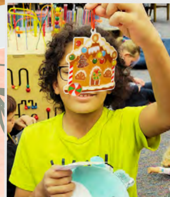
Storytime, snacks, crafts, & photos of their stuffy's overnight experience