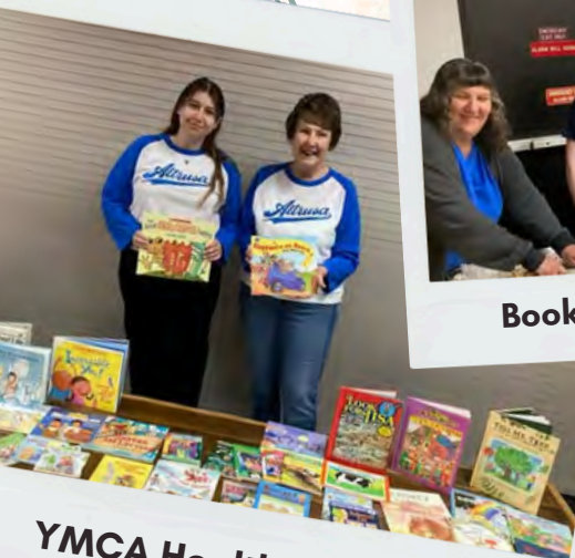
YMCA Healthy Kids Day