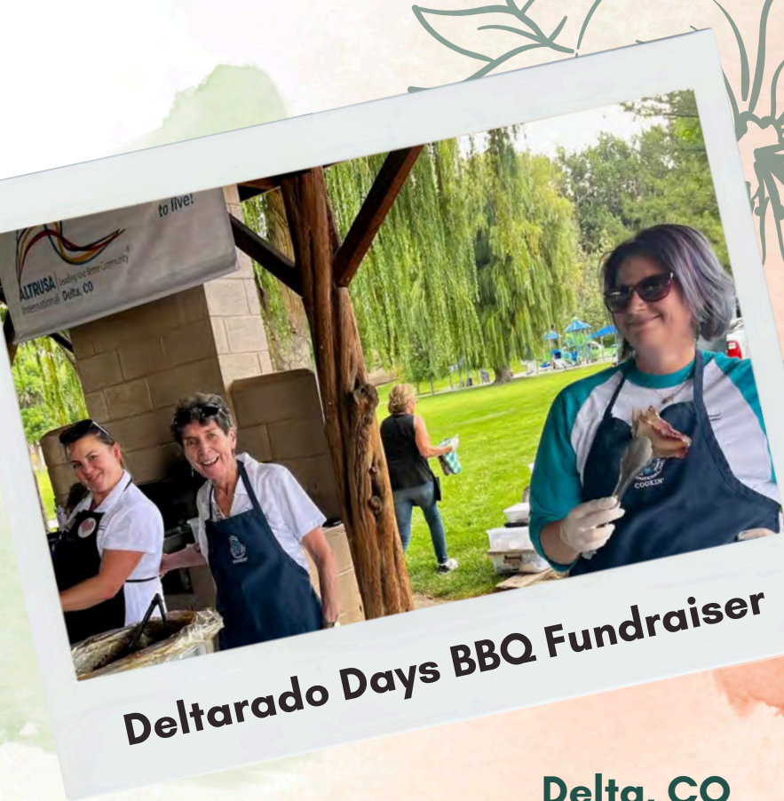
Deltarado Days BBQ Fundraiser