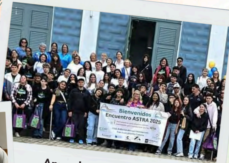
Annual ASTRA Meeting workshops, service projects, & mentorship