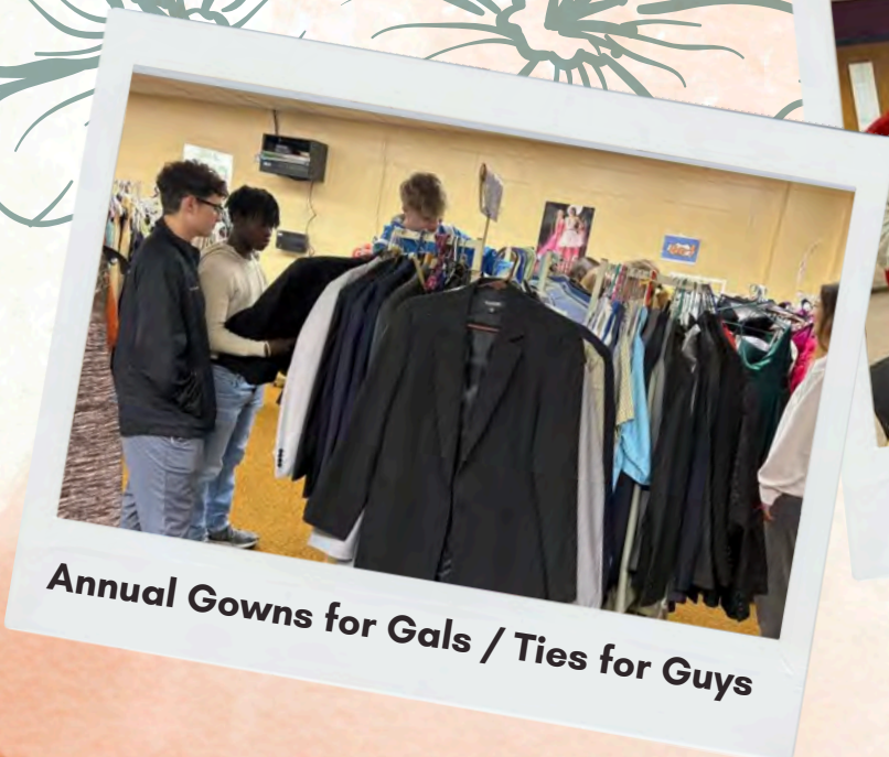
Annual Gowns for Gals / Ties for Guys