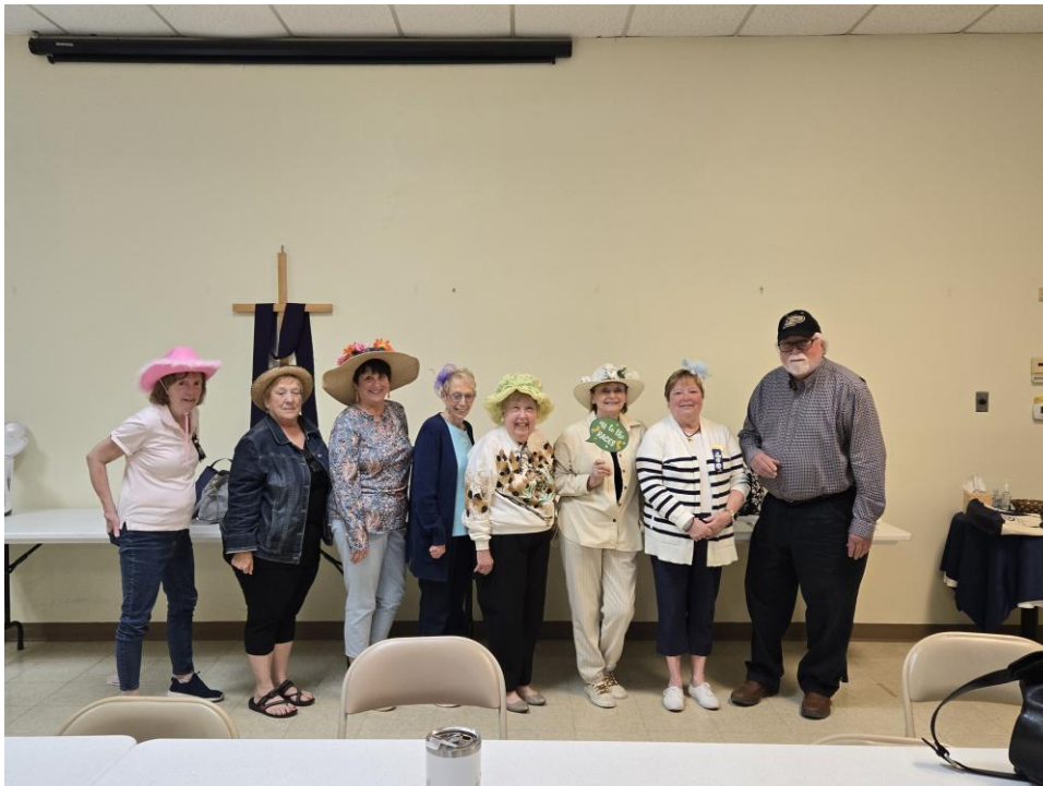
Some members wore hats to our April meeting to celebrate the Kentucky Derby.