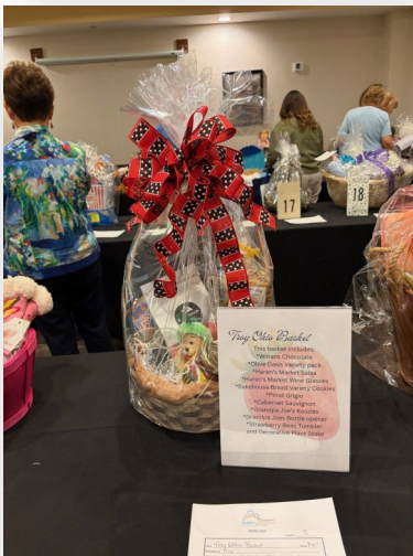
Troy club raffle basket

Troy Club was privileged to win the following awards at conference: