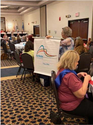
Parade of flags