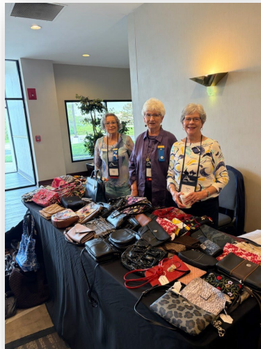
Troy Club Purse Sale